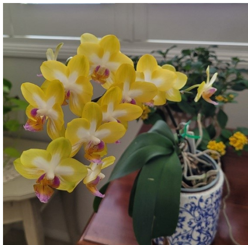
Phal. Yen Shuai 'Sweet Girl'