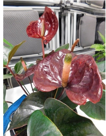
Anthurium Love Black