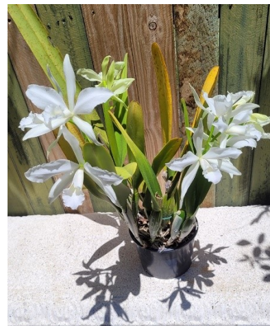
L. Purpurata Alba var (Beauty x Bride) x Sib