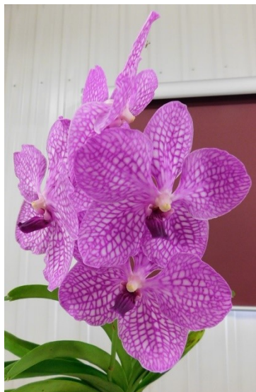
V. Pachara Delight 'Nakornsawan Pink'