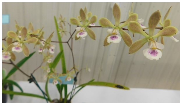
Enc. tamperis X Enc. diurna