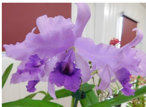
C. bowringiana var. coerulea X Rth. Volcano Blue 'Volcano'