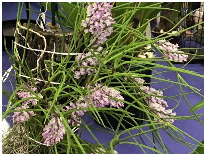
Reserve Champion of Show Schoenorchis funcifolia