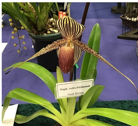
Champion of Show Paph. rothschildianum