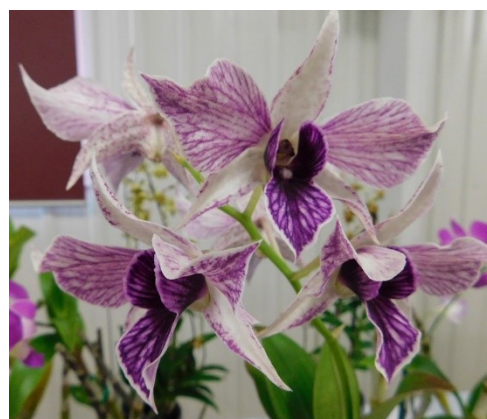
Den. Fire Wings