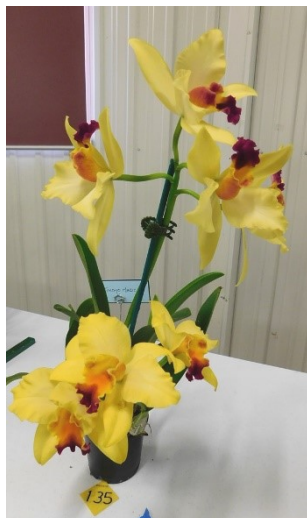
C. Tokyo Magic