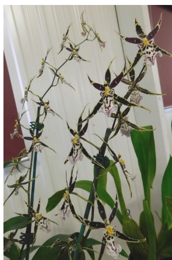
Brdsm. Golden Gamine 'White Knight'