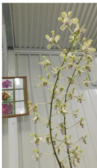
Den. Yellow Jacket