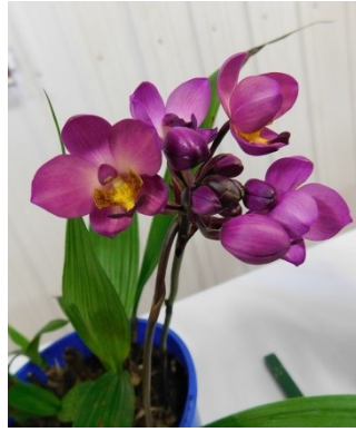
Spa. plicata 'Rocking Plum'