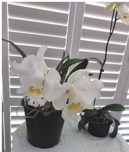
Rlc. Burdekin Pearl 'Nicole'

‘MISSTIMED BLOOMS’ - Those plants that flower when there are no meetings (or you can’t get there) or Shows!