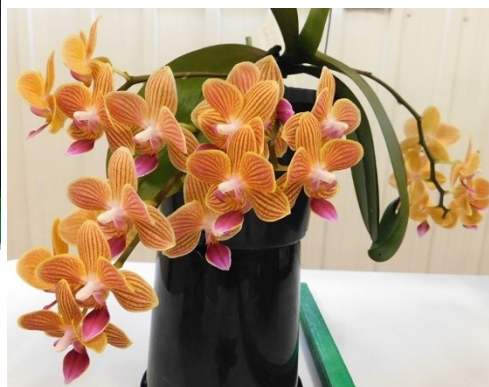
Phal. Chingruey's Goldstate