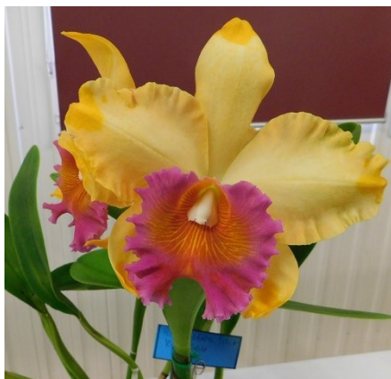
Rlc. Zelda's Star 'Rose Gold'