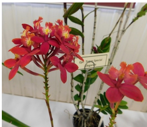
Epi. Topaz Special