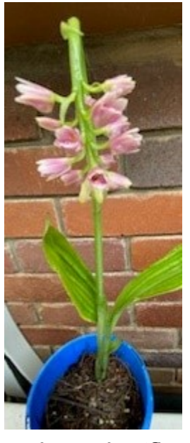
Geodorum densiflorum Aka Shepherd's Crook— quite a number seen in flower on the Island lately.