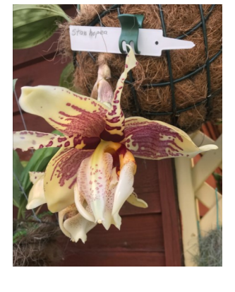
From left to right. One of the many fascinating Stanhopeas flowering at the moment.