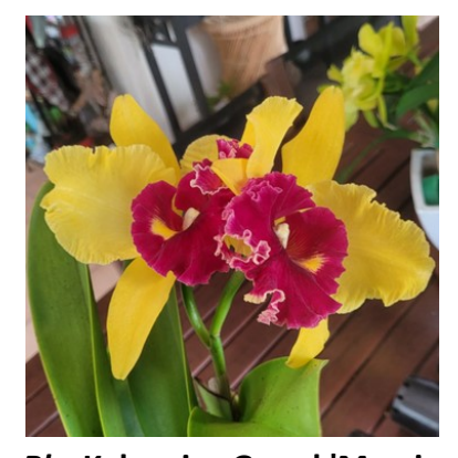
Rlc. Kakemizu Grand 'Margie