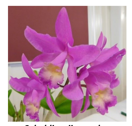
C. loddigesii coerulea