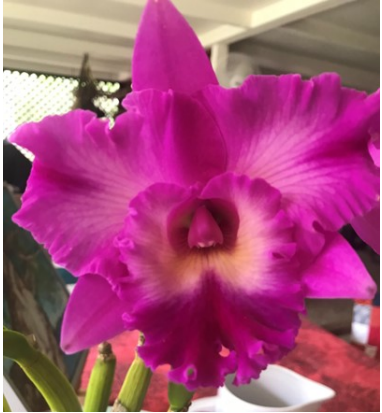
Rlc. Canyon Dusk 'Southern Cross'