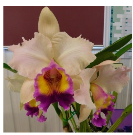
Rlc. Home Hill