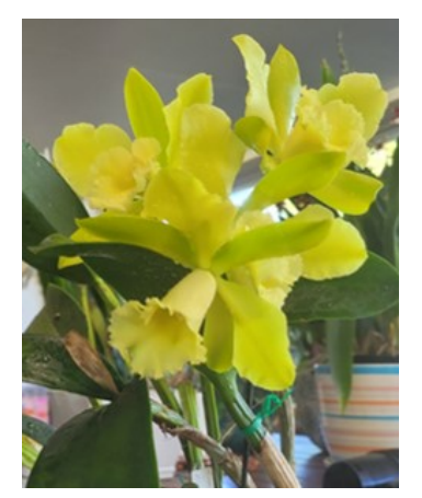
Rlc. Hawaiian Passion 'Carmela' X Rl. Digbyana var. fimbriopetals