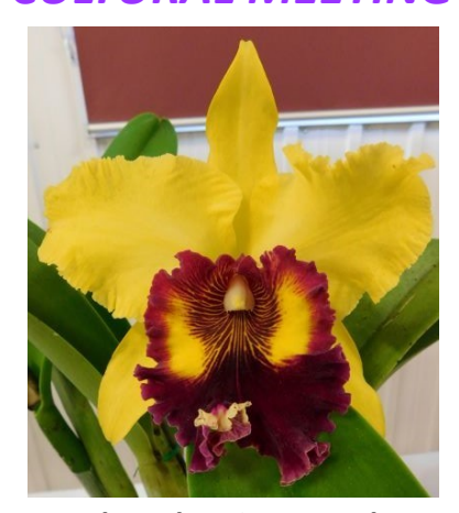
Rlc. Kakemizu Grand 'Margie'