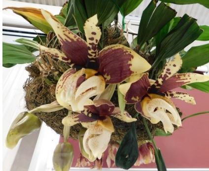
Spa. Mellow Yellow