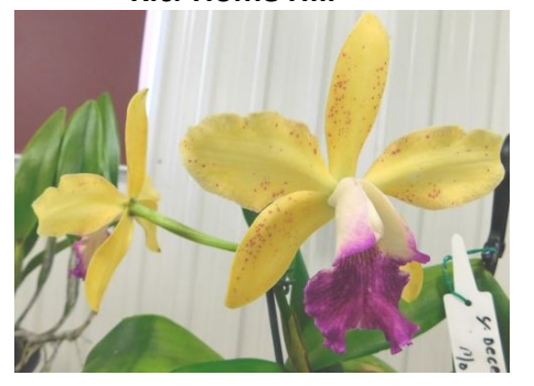
C. Deception Mosaic