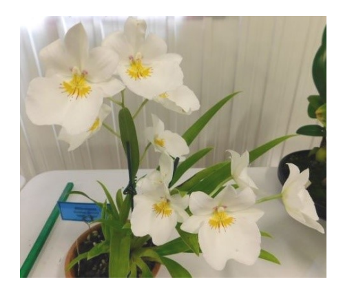
Mps. Golden Snows 'White