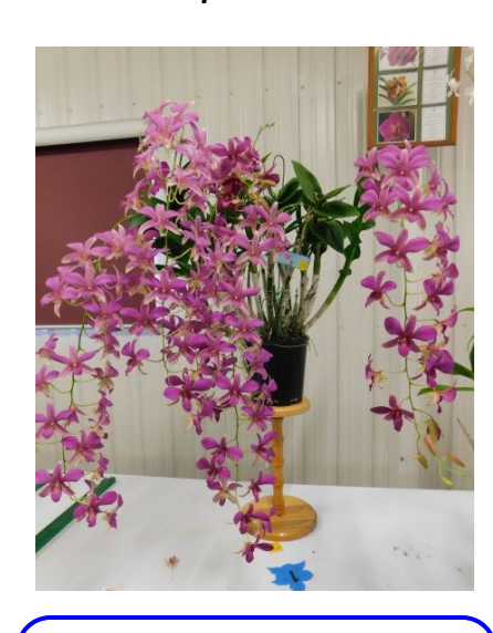
Judges Choice Open & Peoples Choice Orchids Den. Alisun Cherry X Sib.