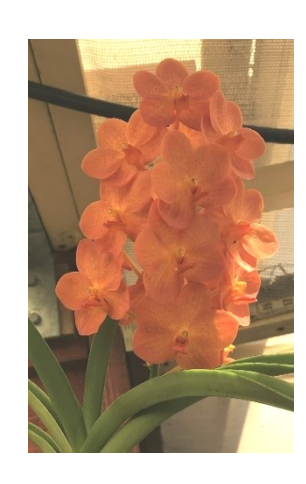
V. Su Fun Beauty