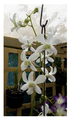
Den. White Fairy