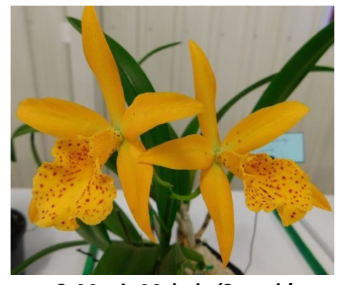
C. Magic Melody 'Superb' (This plant is growing in Canunda Shell)