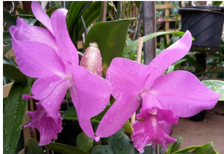
Ctt. Caudekew X C. Caudebec