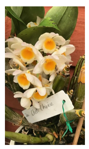
Den. Chet's Choice