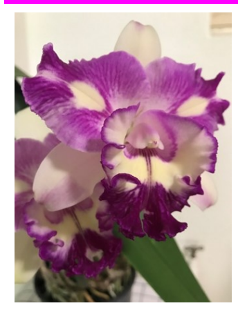
Rlc. Fantasy Maker 'Funny Face'