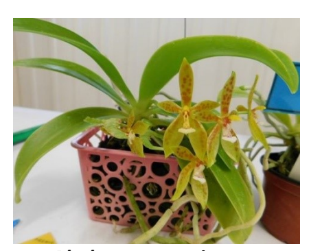
Phal. cornu cervi