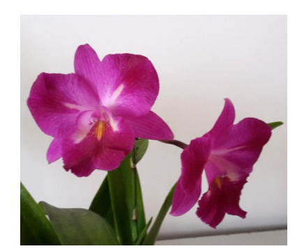
Ctna. Capri 'Lea'

If you have any plants that flower between meetings, email the photos to our Bulletin Editor—sandyjens@bigpond.com for inclusion in the next bulletin.