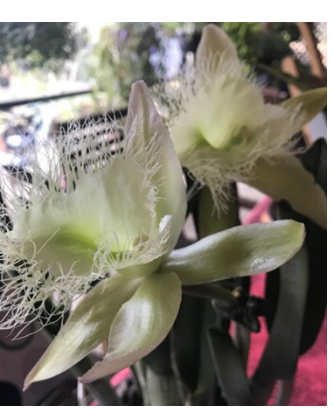
Bc. Digbyana 'Green Ice' Bc. Digbyana 'Mrs Chase'