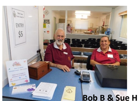
Plus some of our helpers!