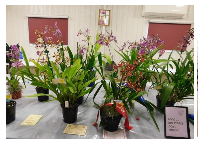
SOME OF THE BEAUTIFUL ORCHID BLOOMS ON DISPLAY!