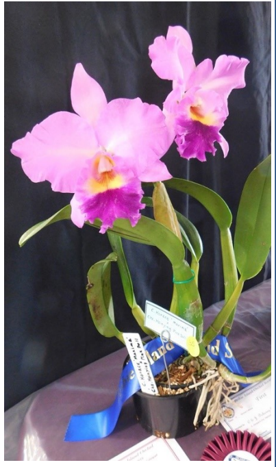
CHAMPION NEW GROWERS C. Horace X Chz. Hsinying Pink Doll Grower C Pickering