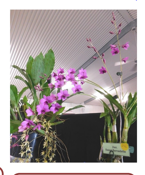
CHAMPION AUTRALIAN NATIVE Den. Sweet Bernadette