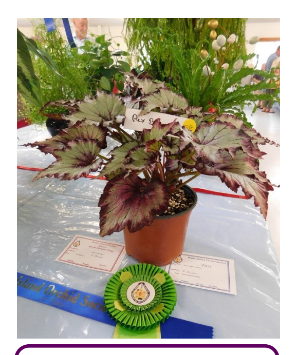
RESERVE CHAMPION FOLIAGE Rex Begonia Grower T. Beenders