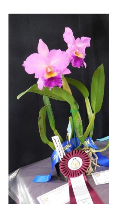
CHAMPION NEW GROWER C. Horace X Chz. Hsinying Pink Doll